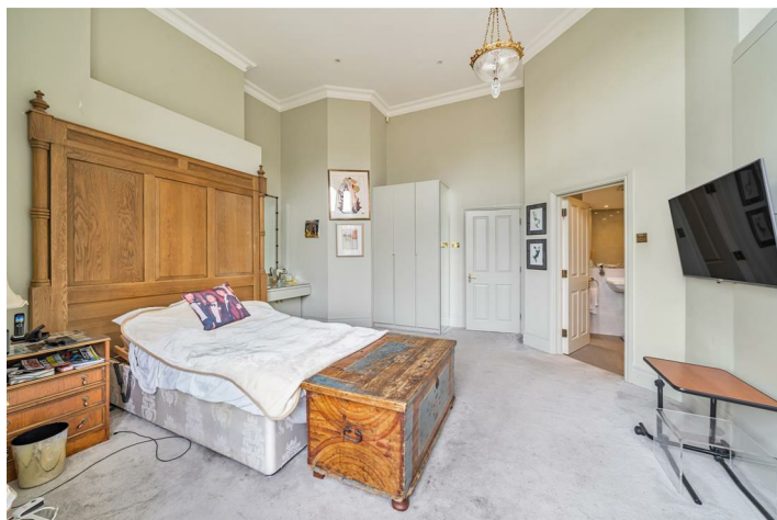
Bedroom one 17'8,17 (5.38m,5.18m)