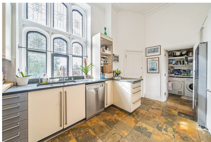
Kitchen 15,10'9 (4.57m,3.28m)